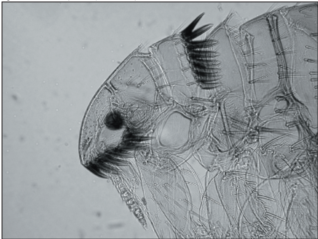
Figure 1. The cat flea (Ctenocephalides felis).